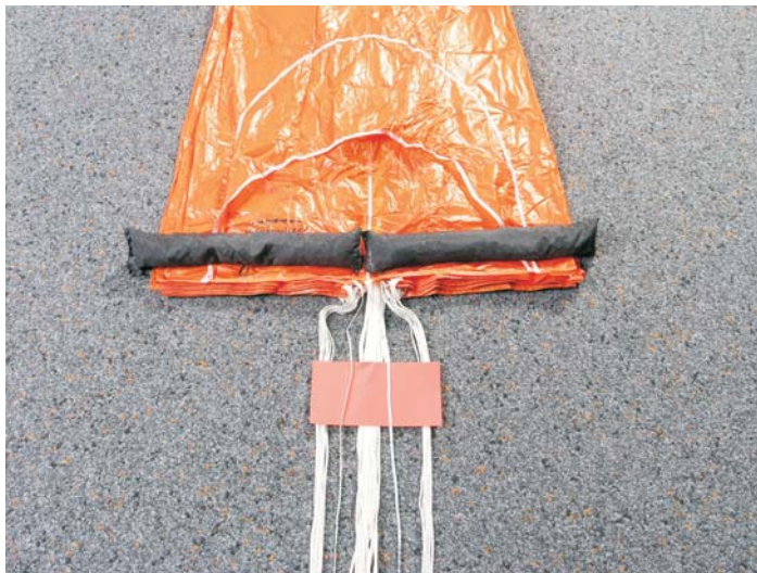
7. Check that line 1 and 20 (Annular EVO 20) and the center line are not twisted and running free. (Annular EVO 22/22HG: 1 and 22; Annular EVO 24/24HG: 1 and 24; Annular EVO Tandem/ Tandem HG: 1 and 30)