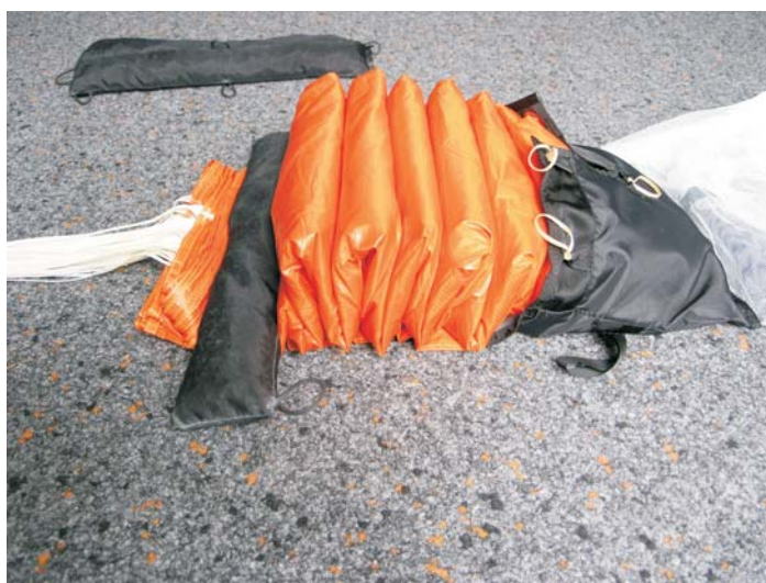
11. Fold the rest of the canopy in small S-folds and place it in front of the deployment bag.