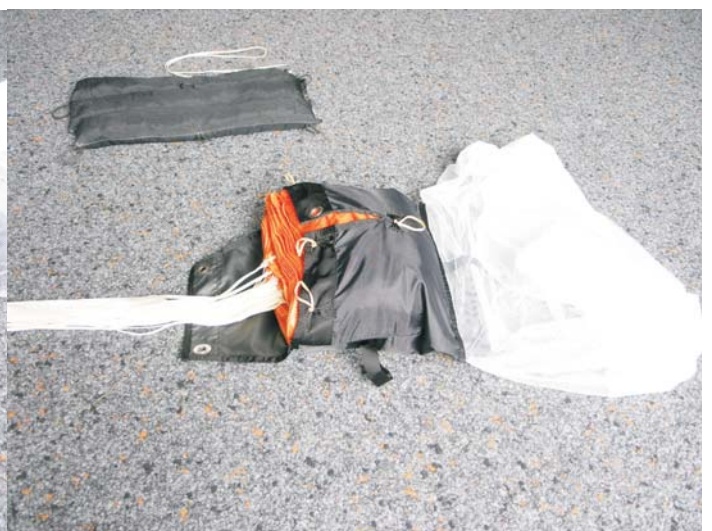
12. Put the S-folded canopy in the deployment bag.