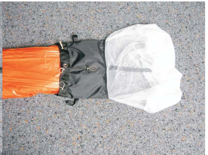
10. Stow the top canopy into the deployment bag.