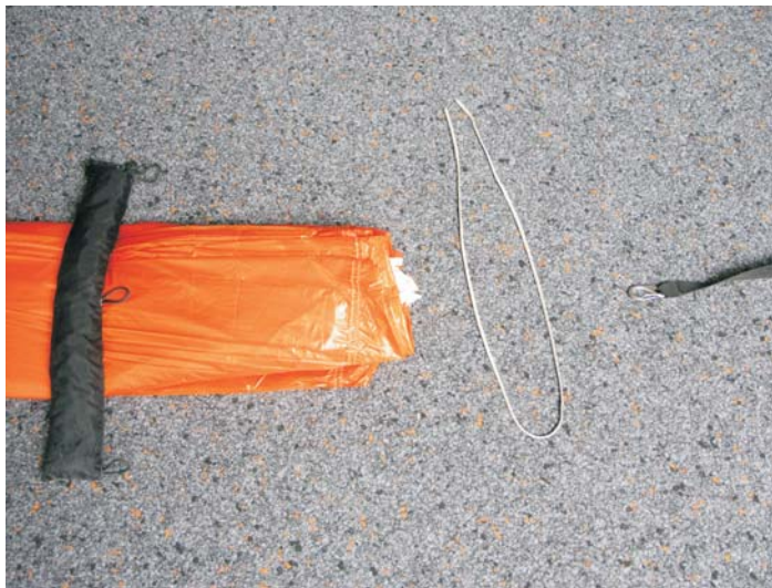
9. Remove the packing cord!