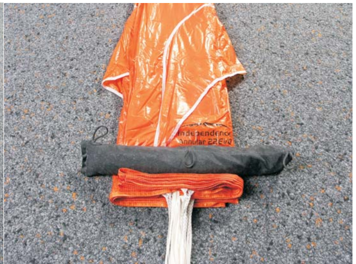
8. Fold the parachute like a "S", and pull out the Ram-Air Pockets a little bit to the side.